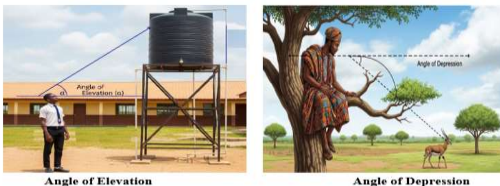
Figure 3: Cultural knowledge associated with angle elevation and depression

region. This practice describes a hunter hiding in a tree watching to kill an animal below (òdẹ tó jókòó lórí igi ní wo ẹranko ní isalẹ). This illustrates a hunter observing an animal from the tree. The angle formed between the hunter's horizontal line and the downward direction toward the animal represents the angle of depression, helping learners understand that it occurs when an observer looks downward from a higher position to an object below. These culturally familiar examples provide meaningful contexts for explaining trigonometric concepts. By linking mathematical ideas, such as angles of elevation and depression, to everyday indigenous experiences, learners can relate these concepts to their local environment in meaningful, scientific ways. (See Figure 3).