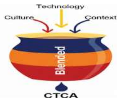
Figure 1: The framework of CTCA

Peter Okebukola conceptualised the Culturo-Techno-Contextual Approach (CTCA). It is a comprehensive pedagogical framework designed to promote students' engagement and inclusiveness during the teaching process (Okebukola, 2020). CTCA was designed to address anxiety in science and science-related subjects by removing barriers to learning through the use of indigenous languages and contextual examples. The proponent of the CTCA argues that the primary goal of every teacher is to ensure that students understand the concepts taught in a meaningful manner. The approach is anchored in three interrelated concepts: (a) cultural alignment, which relies heavily on indigenous knowledge, (b) technological application, the intervention that makes teaching and learning effective and (c) contextual grounding, which includes the significant examples or case studies used to explain the content (See Figure 1).