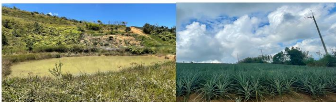
Figure 3 and 4: Lake where monitoring was carried out (left); pineapple cultivation (right)

Figure 3 shows the image of the lake under study, located in the area of influence of pineapple cultivation in the Tabacal village.