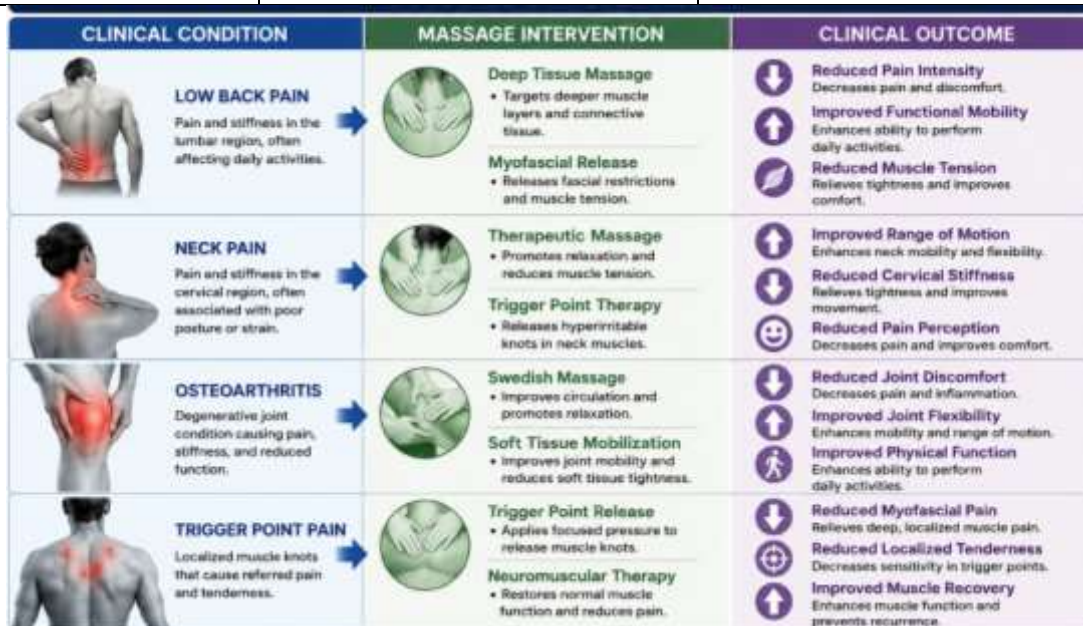
Figure 3: Clinical Applications of Therapeutic Massage in Pain Management.