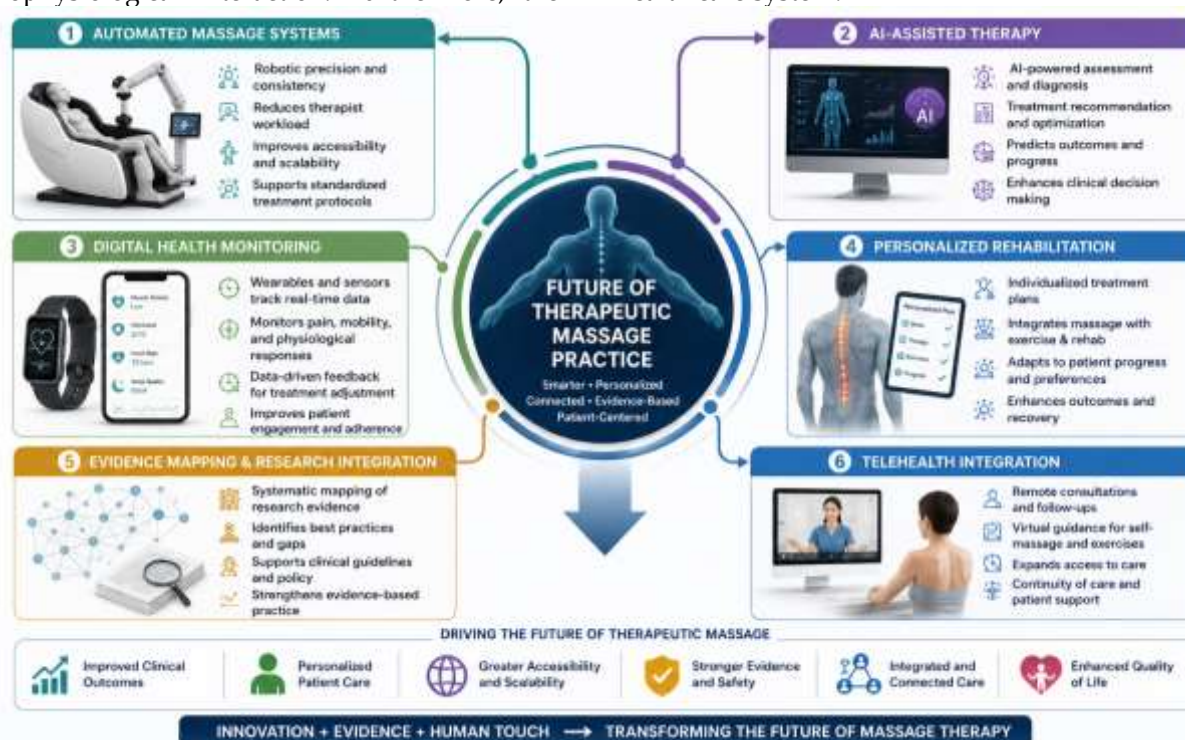
Figure 4: Emerging Technologies and Future Trends in Evidence-Based Therapeutic Massage.

In sum, technology and innovation are contributing more and more to the development of evidence-based therapeutic massage practice. The incorporation of automated systems, digital monitoring devices, evidence mapping approaches, and customised healthcare strategies highlights the continuous advancement of therapeutic massage in contemporary healthcare settings. As science and technology continue to grow, therapeutic massage is likely to become more and more standardized, evidence-based, and part of a multi-disciplinary health care system.