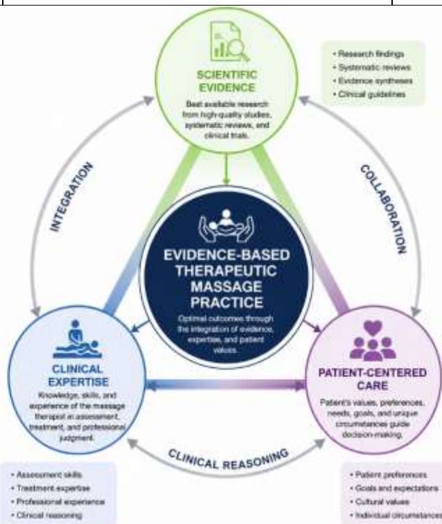
Figure 1: The Three Pillars of Evidence-Based Therapeutic Massage Practice.