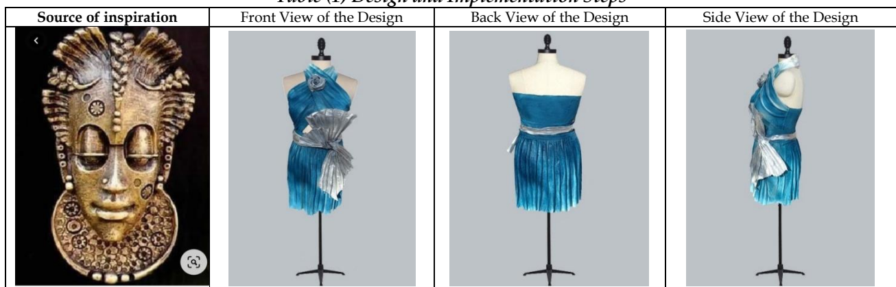
Table (1) Design and Implementation Steps

In the end, certain techniques are used to shape the paste, whether it is still soft or after being solidified. To achieve the best results, such techniques must be appropriate for the ultimate shape and function. The complete designs are displayed in the following table: