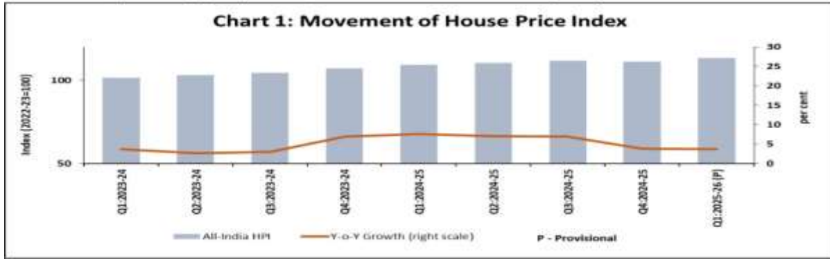
Figure 3. Quarterly Movement of the All-India House Price Index (HPI), 2023–24 to 2025–26 (Base Year: 2022–23 = 100)