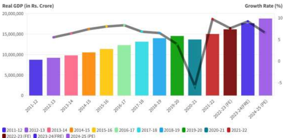
Figure 1. Annual GDP Estimates and Growth Rates at Constant Prices (2011-12 to 2024-25)

The macroeconomic environment in the four states of Maharashtra, Tamil Nadu, Karnataka and Gujarat depicts a sound long-term growth pattern within which the dynamics of housing domains in the identified cities is patterned. The estimates of the national GDP between 2011-12 to 2024-25 indicate a consistent growth, a short term decline in 2020-21, and robust recovery thereafter (Figure 1).