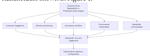
Figure 1: Dominance of Community Engagement in CSR Practices.

The increasing role of diversity and inclusion in CSR strategies is indicative of changes in the society concerning the notion of ethical responsibility and social justice. Sports organisations have become more aware of their powerful nature in influencing the discourse of people and their social consciousness. Therefore, diversity and inclusion CSR are often addressed in the communication policies of sports leagues. Such initiatives do not only solve societal issues but also assist organisations to match the institutional values to the expectations of the stakeholders shown in Figure 1.