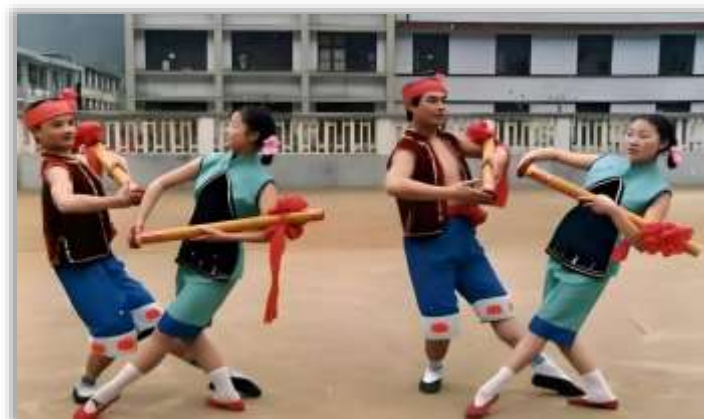
Figure 4: Hanzhong Vocational and Technical College's Folk Song Zhenba Performance, Shaanxi.

Folk songs play an important role as an educational tool and a means of transmitting local knowledge. They act as a medium of learning, both in informal learning systems within communities and in formal educational systems in various institutions. In the context of communities, Zhenba folk songs are transmitted through intergenerational learning processes, through listening, singing, and participation in cultural activities such as rituals, festivals, and annual festivals, which are areas of practical learning that contain knowledge of language, history, beliefs, and ethical values. In the context of educational institutions, Zhenba folk songs are integrated into the curriculum at primary, secondary, and tertiary levels, linking them with the content of music, literature, art, and local culture, promoting interdisciplinary learning, and instilling a sense of cultural heritage conservation in students (Song Yun, 2020).