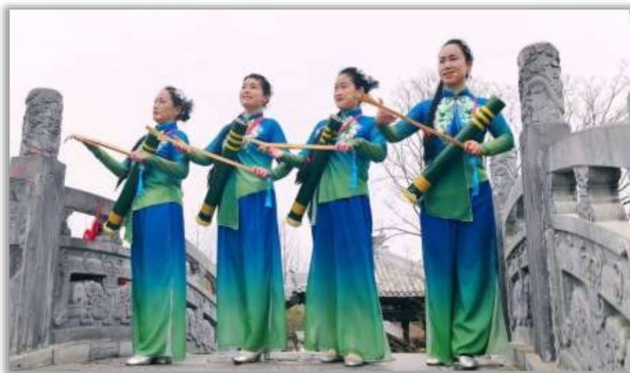
Figure 3: Zhenba Folk Song Performance at Local Festivals.

During festivals, Xunyang folk songs become the glue that binds the community. People of all ages and backgrounds gather around to sing and listen, breaking down social barriers. The shared musical experience creates a sense of belonging, reinforcing the idea that they are part of a collective cultural identity. As the familiar tunes fill the air, the community's unity and solidarity are visibly strengthened. Festivals provide the perfect stage for Xunyang folk songs to transmit cultural heritage. Through the lyrics and melodies, the songs tell stories of the region's history, traditions, and values. Older generations pass down these musical treasures to the young, ensuring that the unique customs, ancient wisdom, and historical memories of Xunyang are not lost but are instead carried forward through the ages.