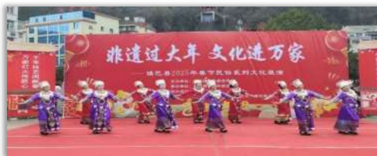
Figure 2: Zhenba Folk Songs Spring Festival Performance.

Folk song duets and choral performances during festivals are important forms of social entertainment for the public. Men, women, the elderly and children gathered together, making friends through songs and exchanging ideas with each other. For instance, during the Spring Festival, there is a "singing competition" where singers improvise lyrics, engaging in a contest of wisdom and talent. This not only enhances the bonds among neighbours but also strengthens the cohesion of the community, allowing people to enjoy the joy of the festival and the warmth of reunion through singing (Xu Tao, 2012).