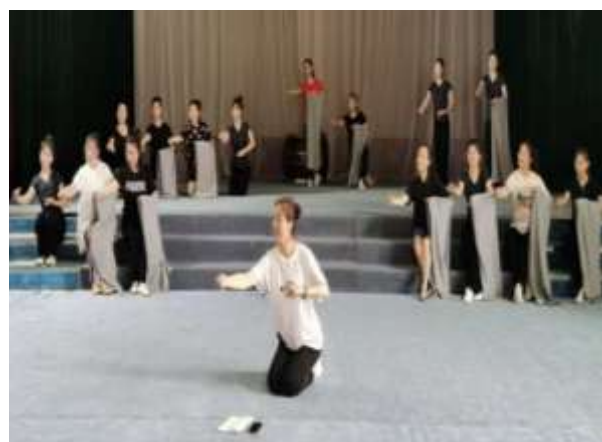
Figure 3: Activities for teaching Lyu Opera to youth and educational institutions.

training, which requires prolonged immersion and continuous refinement of basic techniques, must be restructured into progressive modules that allow learners to gradually develop artistic perception, technical stability, and stylistic awareness. Age-differentiated teaching models have proven particularly effective in enhancing sustainability: youth-oriented programs prioritize systematic technical transmission and foundational skill development, while programs for older learners emphasize cultural participation, appreciation, and experiential engagement. Such stratified teaching frameworks contribute to the formation of a stable and inclusive transmission ecology. (Du Ning, 2013).