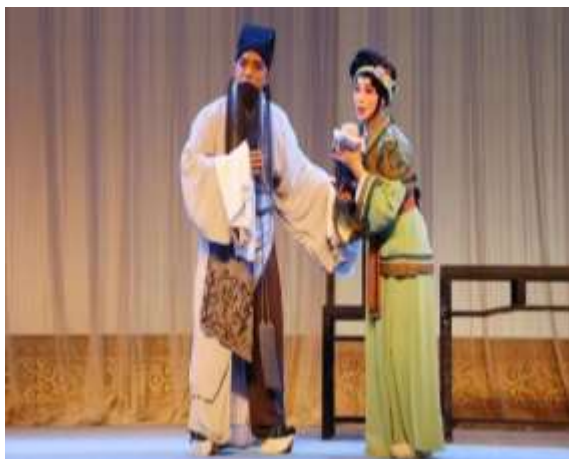
Figure 1. performance at the scene of Lyu Opera.

At the micro level, deficiencies in artistic transmission—particularly in vocal techniques—have become increasingly evident. Breath control has long been regarded as the technical foundation of Lyu Opera singing, requiring stable diaphragmatic support and precise coordination with melodic structure. However, current training practices often prioritize stage exposure over foundational skill development. Young performers tend to neglect systematic breath training, leading to unstable sustained notes, disordered breathing in fast passages, and weakened expressive control. Moreover, the growing substitution of traditional vocal techniques with popular singing styles has resulted in the gradual loss of local timbral characteristics, causing vocal expression to become increasingly homogenized and detached from the distinctive aesthetic of Lyu Opera. (Zhu Yiwen, 2020).