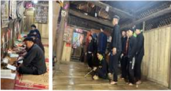
Figure 4: The Master Summons The General And Conducts The Spirit Possession Ritual, Channeling Spiritual Entities Into Participants. This Step Reinforces Ritual Authority And Highlights The Transmission Of Sacred Knowledge.