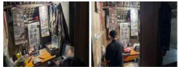
Figure 2: The First Step Of The Cap Sac Ritual, Where The Master Reports To The The Altar Of Master Cap Sac's House. This Action Initiates The Ritual, Consolidates The Master's Authority, And Highlights The Importance Of Formal Notification For The Legitimacy Of The Ceremony.

The following figures, documenting various stages of the Cap Sac ritual performed by the San Chay community in Thai Nguyen, Vietnam, were collected by the author during fieldwork.