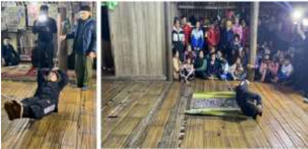
Figure 5. Participants Undergo Trials Lying On The Ritual Rope And Rolling Over Embers, Symbolizing Purification, Endurance, And Commitment. This Step Embodies The Transformative And Testing Aspect Of The Cap Sac Ritual.