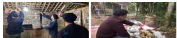
Figure 3: The Ritual Masters Set Up The Altar And Performs The Reporting Ceremony To Tho Cong, Marking The Formal Initiation Of The Ritual. This Step Reflects The Master's Communication With Spiritual Authorities And Reinforces The Ritual Hierarchy And Legitimacy Within The Community.